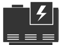
Small Power Generators